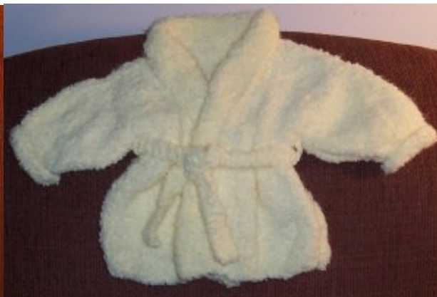
Paton's Be Mine